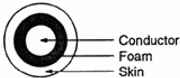
Fig. 1. Foam/Skin Construction

There are two layers in high density polyethylene (HDPE) foam/skin insulation for telephone singles, an inner layer of foamed polymer and a thin outer layer of solid polymer (Fig. 1). The thin solid outer layer, or skin, provides the mechanical properties and protects the foam. The inner foam layer decreases the electrical capacitance of the overall insulation, which allows closer spacing of the insulated conductors in the telephone cable. Air in the voids of the HDPE has a dielectric constant of 1.00 compared to the dielectric constant of approximately 2.32 for HDPE.