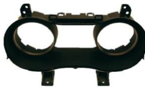
IP Cluster Bezel