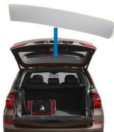
Roof Column Trim