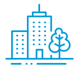
Building & Construction