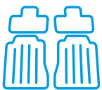
Floor Mats & Mud Flaps