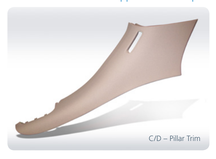
Softell Textile - Application Examples