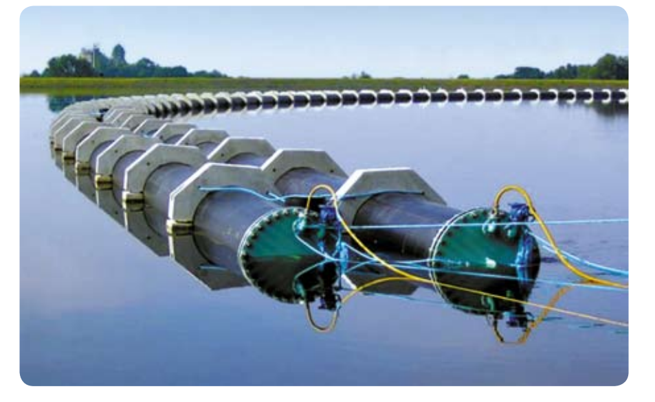
Fig 4: Twin Marine Pipelines DN 1100 made from Hostalen CRP 100 black (PE 100) prepared to be placed in the Craigmaddie Reservoir

The pipe lengths for the marine pipelines are welded on a suitable place on the lakeside by heated tool butt welding, simultaneously, sink weights were installed before the pipelines were pulled on the Reservoir.