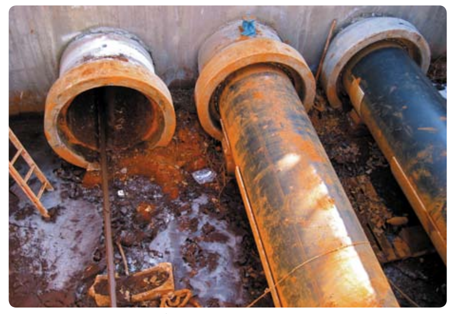
Fig. 7: Pipe lengths in an inspection shaft