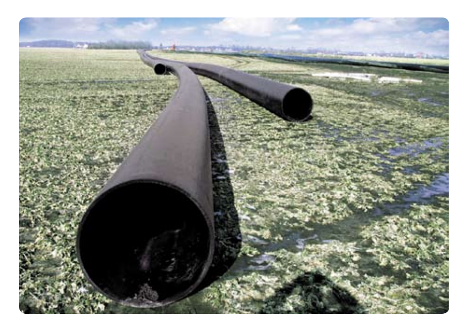
Fig. 5: Pipe length made of Hostalen CRP 100 black, manufacturer SIMONA AG