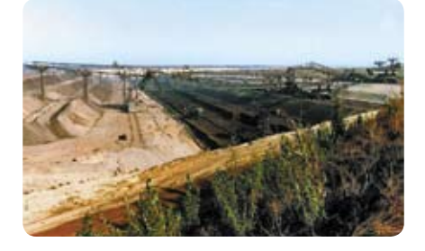
Fig. 2: Lignite power station "Schwarze Pumpe"

Fig. 1: Open-cut lignite mining with mine bridge